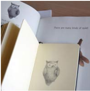
A small sketchbook for a small drawing.