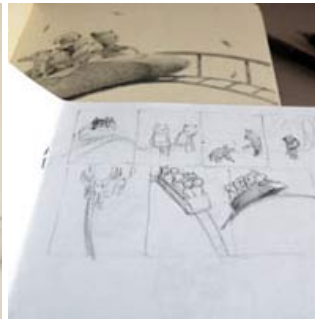
Trying to figure out how to say quiet.