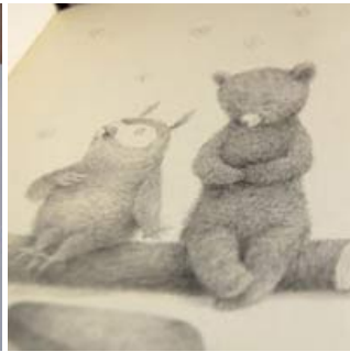
The owl gets emotional in the final drawing.