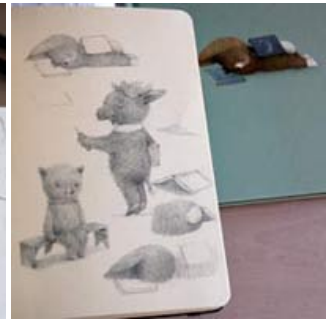
Some of these guys got left out of the book.