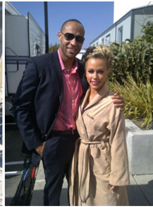
On the set of DWTS. Hmmm... wonder why I'm smiling?