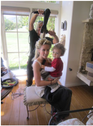
It's all about multitasking.